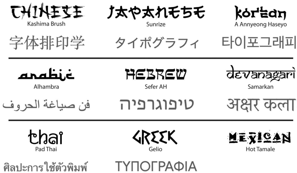
Figure 1. Different mimicking typefaces, all available in the category “Foreign look” on dafont.com (accessed 10 May 2021) as well as specimens from the actual target scripts (taken from the Wikipedia pages on “typography” in the respective languages).

2020a, Chapter 1). Instead, it appears to be a rather intuitive and subjective affair. For example, in his process of creating a mimicking typeface, French type designer Jean-Antoine Alessandrini (1983)