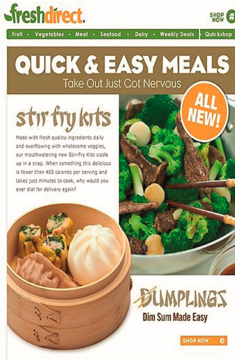
Figure 3. FreshDirect ad.

mimicry to advertise (Chinese) food. This corresponds with the second type of typographic knowledge and basis for making meaning of typographic mimicry mentioned above. Crucially, in such cases, the producer's intention is arguably still to index (albeit indirectly) a given culture. Thus, shifting the blame to someone else for having used this practice before – and directly, as in referring to the culture rather than relying on previous instances of typographic mimicry – does not absolve a producer from the responsibility of engaging in it.